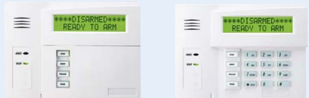
(shown without door)

By combining a keypad with a 5800 Series Wireless receiver/ transmitter and an on-board relay, you get an integrated design that cuts installation time and reduces material costs.