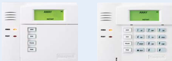
(shown without door)