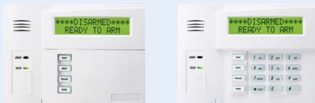
(shown without door)