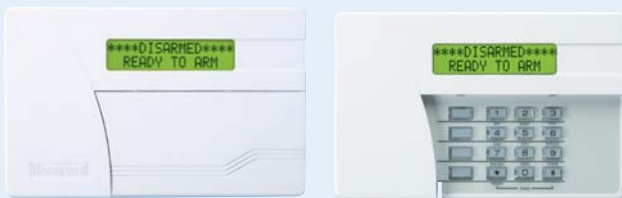
(shown without door)