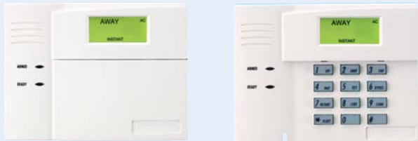
(shown without door)