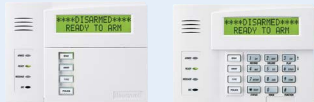
(shown without door)