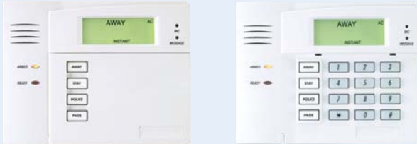
(shown without door)

With no wires to run, wireless keypads drastically reduce installation time and labor costs.