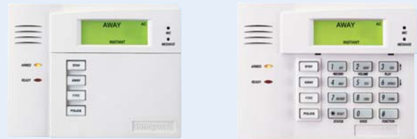
(shown without door)

Voice keypads take the guesswork out of operating a security system. By speaking system status and zone information, voice keypads offer you a great upsell opportunity.