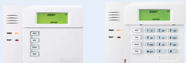
(shown without door)