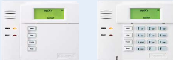
(shown without door)