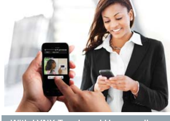
With LYNX Touch and Honeywell Total Connect you can: