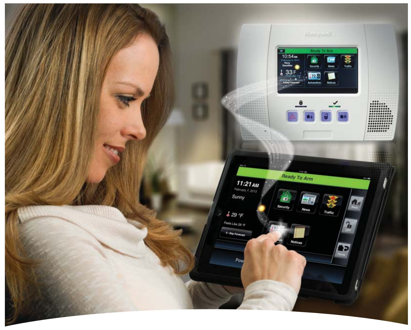
DYNAMIC, FULL COLOR SELF-CONTAINED HOME CONTROL SYSTEM