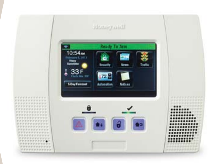
Sleek, stylish look suits any décor.

LYNX Touch Self-Contained Home Control System